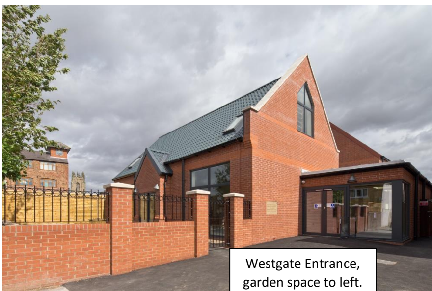
Westgate Entrance, garden space to left.

This, along with the Schoolroom solar panels, reduces our dependence on other energy sources and also generates an income from the Renewable Heat Incentive. Bi-fold doors between the worship space and cloister area can be opened to facilitate larger events. Access control using proximity fobs gives good security and auditing of use with maximum flexibility. Safety and protection is facilitated by installed CCTV.